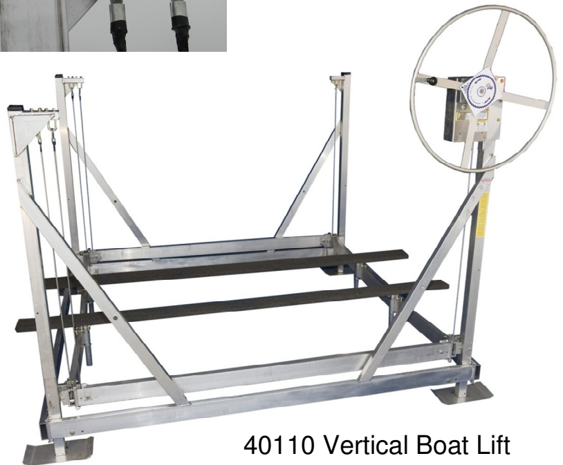
40110 Vertical Boat Lift

"U" Bolt terminal connectors are used for the strongest possible cable anchors